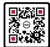
Winged Wire Connectors

Scan for a complete listing of wire combinations and voltage ratings