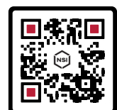
Standard Wire Connectors